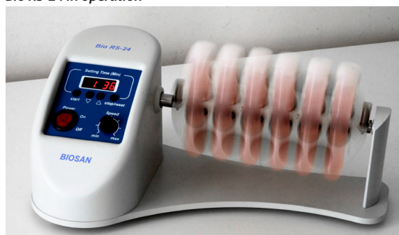
Bio RS-24 in operation