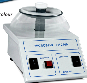
FV-2400 white colour (optional)