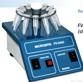
FV-2400 blue colour (standard)

FV-2400 is an "open type" centrifuge (without lid), that increases the speed of centrifugation and resuspension operations.