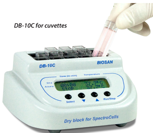
DB-10C for cuvettes